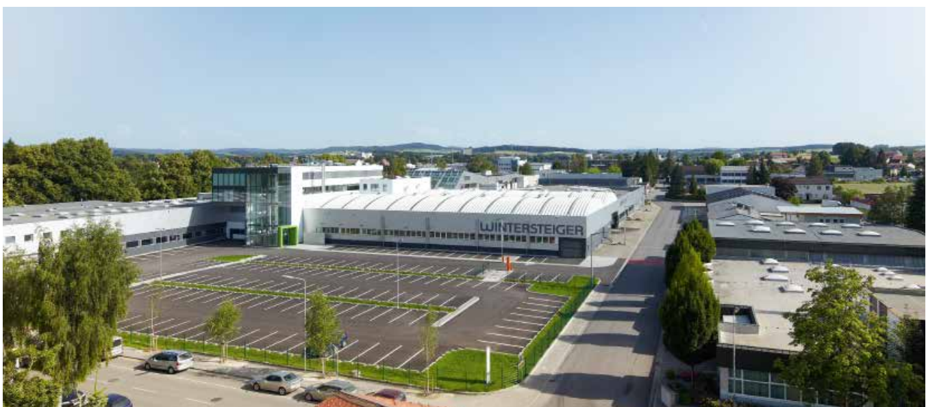
Company head offices at Ried im Innkreis, Upper Austria